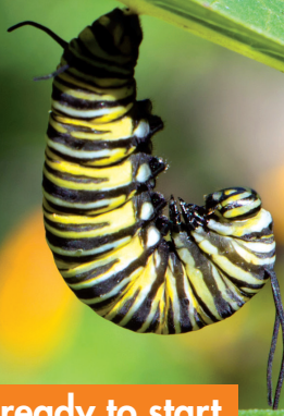
Getting ready to start the chrysalis stage